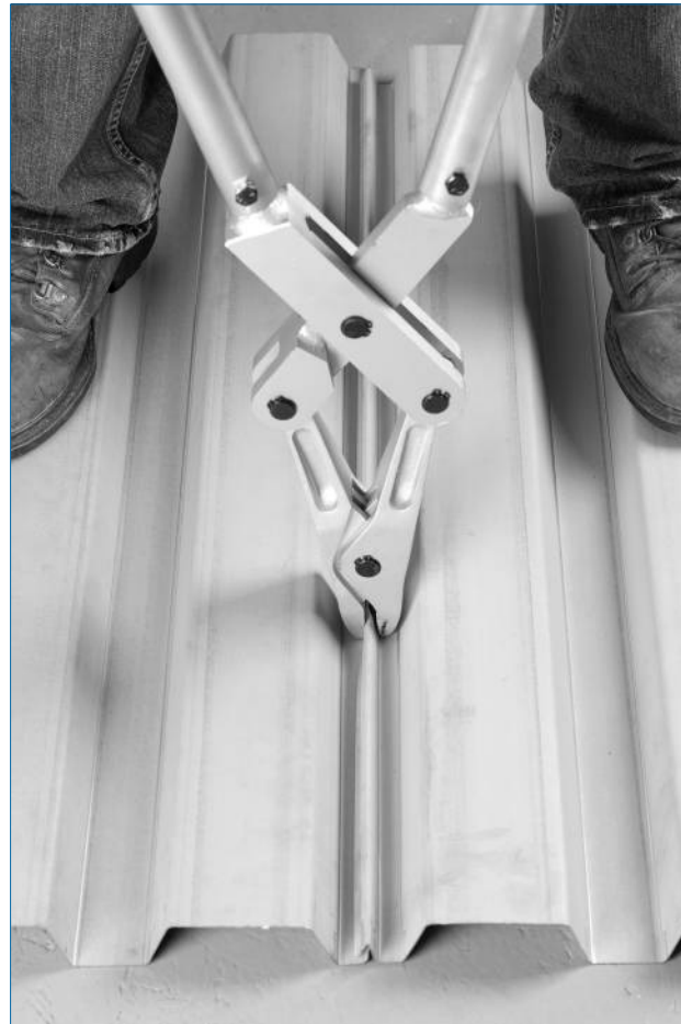
Figure 2: Button Punch Side Lap (Hand Crimping)

It is hoped that knowing more about the safe handling and installation of steel decking will help structural engineering achieve their goals while recognizing that the advantages need to be weighed against extra cost and safety issues. It is a case of theory tempered by practically.