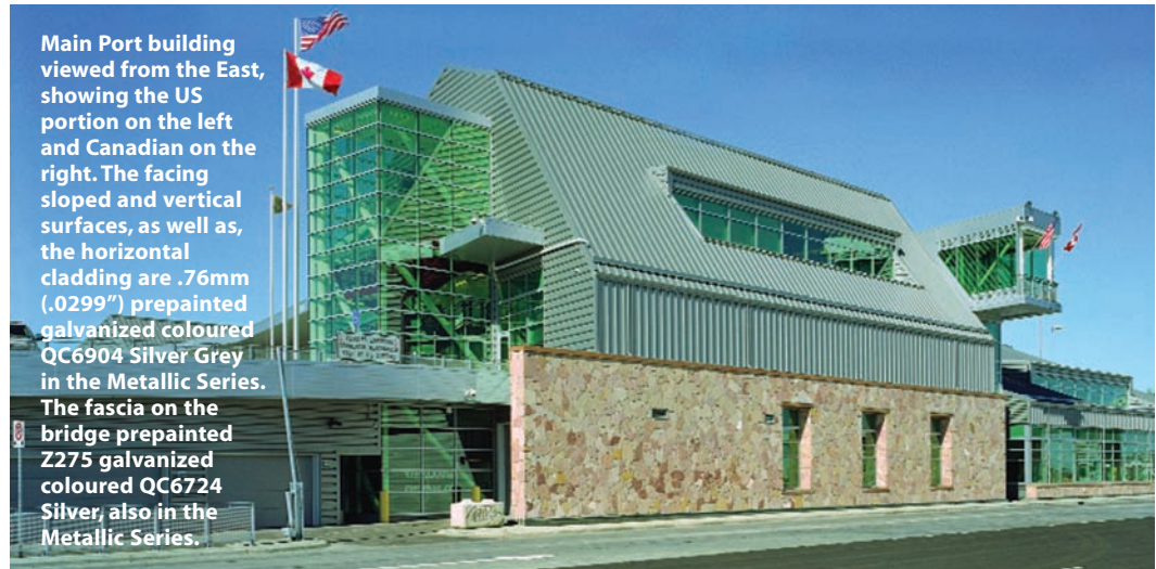
Main Port building viewed from the East, showing the US portion on the left and Canadian on the right. The facing sloped and vertical surfaces, as well as, the horizontal cladding are .76mm (.0299") prepainted galvanized coloured QC6904 Silver Grey in the Metallic Series. The fascia on the bridge prepainted Z275 galvanized coloured QC6724 Silver, also in the Metallic Series.

Structural Steel Supplier & Installer: Anglia Steel, 403-720-2363